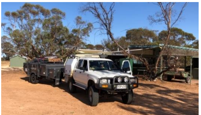
Packed up ready for home

We spent 3 nights there 2 weeks ago and will be going back for another week in a couple of weeks.