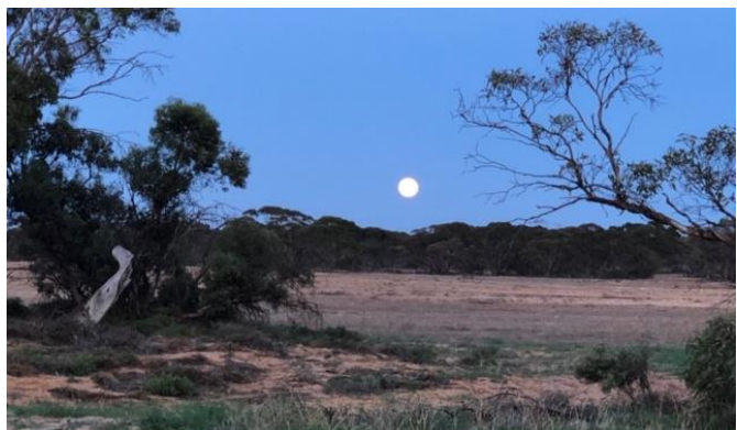
'How's the serenity?'

The Camp is about 25 minutes driving time from the thriving metropolis of Loxton, where you will find a big river to fish in and parks and gardens to go to as well as 24hr fuel and bakery and supermarket. But for just sheer relaxation, peace and quiet, the camp is the place to be.