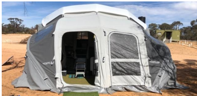
'Home Sweet Home'

The camp has a kitchen and dining room facility and a generator shed toilet and showers with hot and cold running water. There are marked out campsites to set up caravans or tents. There is also a caravan with 3 beds inside. There is not much to do there but at $5/vehicle/night it is a good place to stay. Another bonus for those who like to take their fur babies along with them the camp is pet friendly.