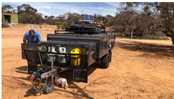
Jarrad Sets Up

The camp has a kitchen and dining room facility and a generator shed toilet and showers with hot and cold running water. There are marked out campsites to set up caravans or tents. There is also a caravan with 3 beds inside. There is not much to do there but at $5/vehicle/night it is a good place to stay. Another bonus for those who like to take their fur babies along with them the camp is pet friendly.