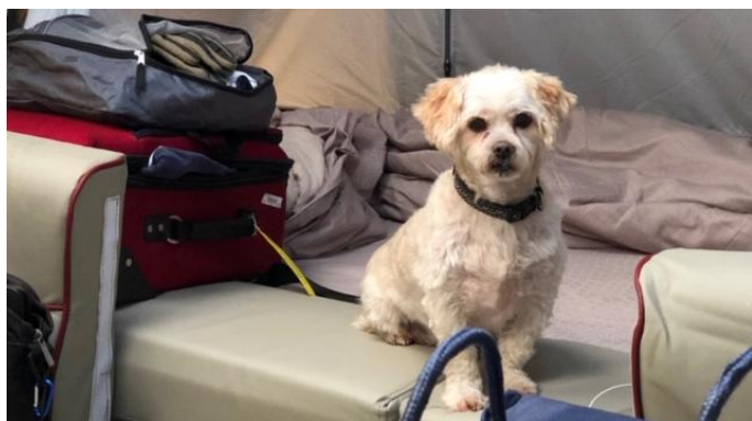
"I guess this will have to do"

The Camp is about 25 minutes driving time from the thriving metropolis of Loxton, where you will find a big river to fish in and parks and gardens to go to as well as 24hr fuel and bakery and supermarket. But for just sheer relaxation, peace and quiet, the camp is the place to be.