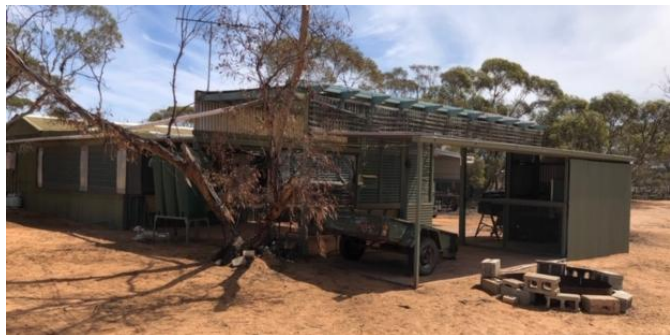
The Camp Kitchen and Dining Room

The camp is approximately 1.2km south of Alawoona on the Lameroo Road, as you head south just look for the big white tractor tyre with CAR painted on it, turn right, follow the track into the camp.