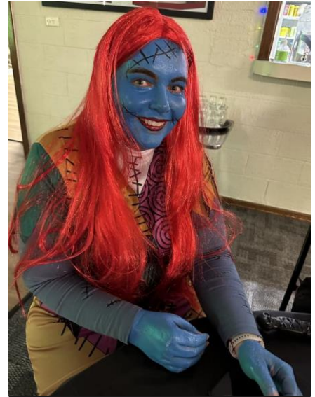
An Unusually Coloured Jo