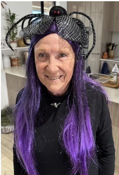
New Hair Coloured Sandy