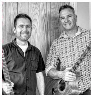
Six String Acoustic