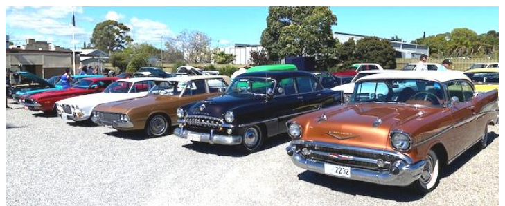
Some of the cars on display

For a Gold Coin donation Judy (Tina Turner) welcomed visitors to enter