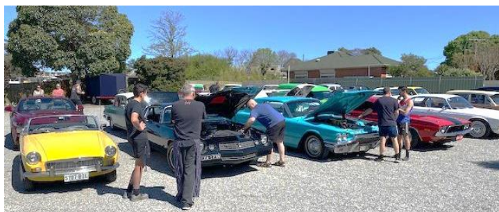
The sort of the cars that will be on display

For a Gold Coin donation visitors will be able to enjoy the sun, refreshments and entertainment. Entry will be free to RSL Members.