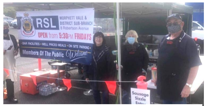
Rain hail or shine, our team are always ready to serve you a nice hot sausage and onions.

Open Mic Day is a new event we are also now holding at the Sub-Branch. This initiative encourages beginners and amateurs alike, along with a professional band, to come along and experience some different forms of entertainment.